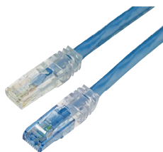
Keyed UTP Copper Patch Cords

Keyed patch cord type is indicated by patch cord color. Select a jack (above) of the same color as the patch cord to match the keyed configuration.