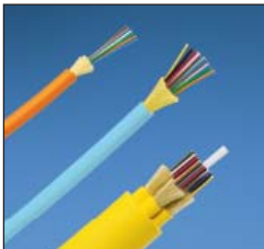
Fibre Optic LSZH Distribution Cable