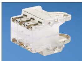
6-Pack recessed Plug Pack – QPPR6S