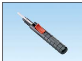
QuickNet™ Removal Tool – QPPRT