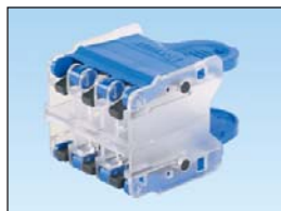
6-Pack Plug Pack – QPPN6BU