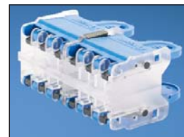
12-Pack Plug Pack – QPPN12BU