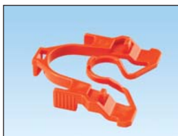
QuickNet™ Lock-In Device – QPPLD6-X and QPPLD8-X