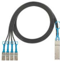
Figure 1: QSFP28 to four SFP28 breakout cable

The goal of the IEEE CFI is to use 25G DAC as the low-cost copper server connection for Top of Rack (ToR) switches. Reach is expected to be about the same as existing passive DAC cables or about five meters. There is speculation that some equipment may only run at three meters, but it is still too early in the process to validate or verify that possibility.