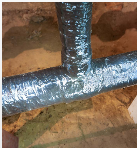
Moisture Sealing & Cable Repair