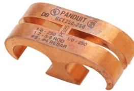
Panduit Power & Grounding