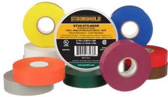
StrongHold PVC Electrical Tape