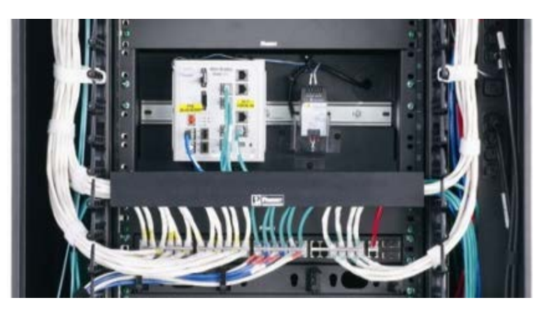
Figure 5. Manufacturing Switch Mounted on a DIN Rail Bracket

There may be cases where network designers may wish to combine DIN rail mounted devices within racks (components such as PLCs, gateways, manufacturing switches, etc.) in order to save space. Placement of DIN rail mounted devices in the MDC may help achieve this benefit by eliminating separate enclosures while closely linking DIN rail mounted devices to the network (see Figure 5).