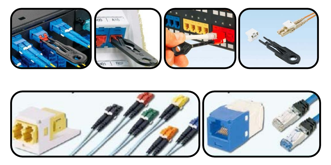
Figure 6. Panduit Lock-In, Blockout, and Keyed Connectivity Devices for Copper and Fiber Optic Cabling Deployments Help Mitigate Physical Security Risk in the MDC Infrastructure

Ensuring the network is protected from unwanted intrusion or erroneous connections is of major concern in any environment (see Figure 6). Cable security is essential to achieve a full physical "defense in depth" strategy. Unused network ports can be blocked with plastic inserts (blockouts) to prevent unauthorized or mistaken access. Critical cabling can be "locked-in" to ports to prevent accidental or malicious disconnections. A further layer of security can be achieved through the use of keyed jacks and connectors that require specific keyed patch cords for connection.