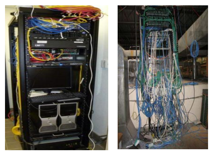
Figure 2. Poor Industrial Network Installation Can Generate Unacceptable Downtime Risks

A Micro Data Center (or MDC) is a versatile combination of hardware, software and cabling that serves as an end-to-end networking hub, similar to a telecommunications room or network room but much smaller scale than the typical enterprise data center. The defining characteristic of an MDC is that it houses a complete data center infrastructure in a single