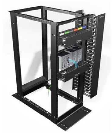
Figure 4. Example Panduit 4 Post Rack (half or full) with Cable Management Deployed for Micro Data Center Application

The housing (i.e., rack, see Figure 4) needs to accommodate all equipment, patch panels, and cable managers while providing a growth factor of between 30-50% to accommodate future expansion. For small MDCs, half-height racks or cabinets may be sufficient, while large installations may require full size or multiple racks/cabinets.