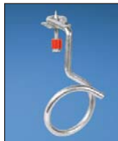
Power Actuated Fastener