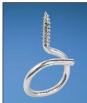
Wood Screw Thread