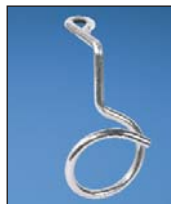
User Supplied Nail or Fastener