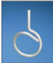
Non-Threaded #8 Wire