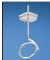
Integrated Toggle Screw