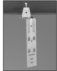
Screw-On Beam Clamp Bracket