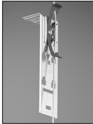
Drop Wire Bracket