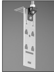
Threaded Rod Bracket