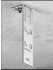
Ceiling Mount Bracket