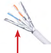
Foil shield in cable prevents unwanted alien crosstalk