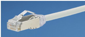
STP28X#M ^ (F/UTP)