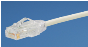
UTP28SP#M ^ (UTP)