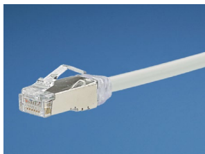
STP28X#M ^ (F/UTP)

^ = Color. No suffix designates Off White color. For other colors, suffix: BL (Black), BU (Blue), GR (Green), GY (Gray), OR (Orange), RD (Red), VL (Violet), or YL (Yellow); PK (Pink) is available as cord color option for UTP28SP only.