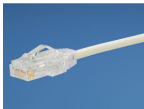
UTP28SP ^ (UTP)