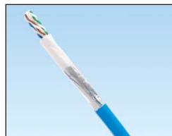
PUP6A04BU-UG and PUR6A04BU-UG