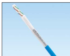
PUP6ASD04BU-UG and PUR6ASD04BU-CG