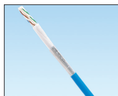
PUP6ASD04BU-UG and PUR6ASD04BU-CG