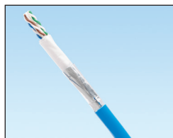
PUP6AM04BU-UG and PUR6AM04BU-UG