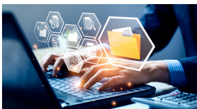
ENTERPRISE BUSINESS OR SMB