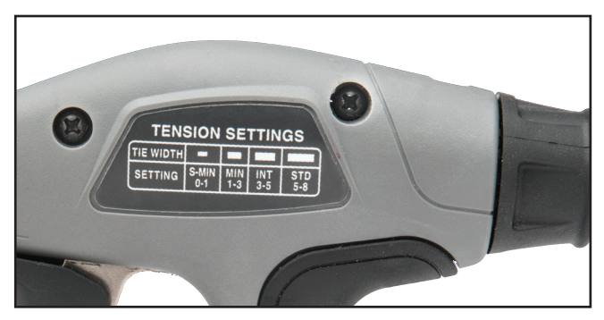
Easy to read Tension Setting Label eliminates guesswork.

To change the tension setting, pull back the Tension Adjustment Knob, match it to the appropriate cable tie cross section tension setting, and disengage the knob.