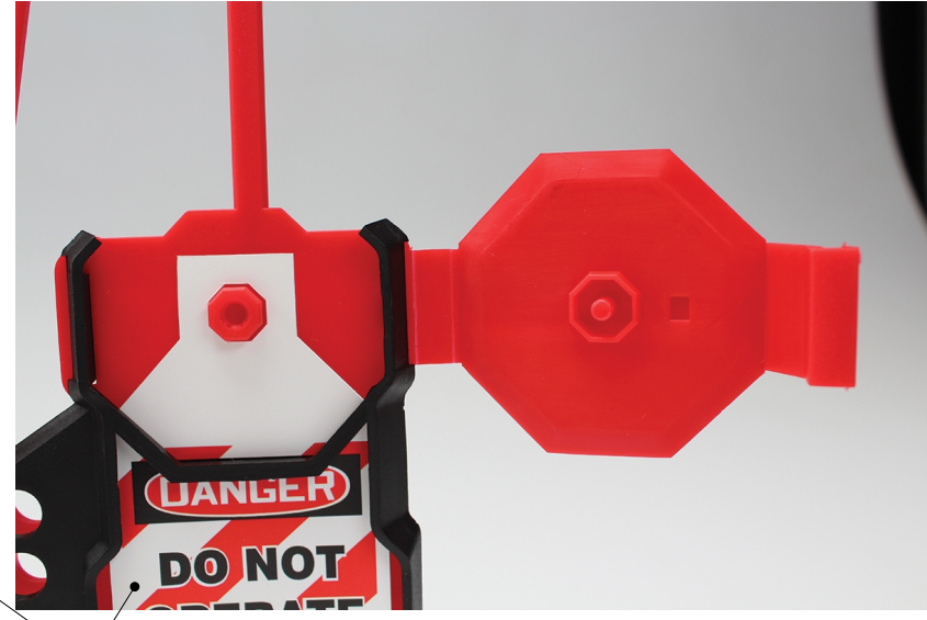
PSL - 1018 PSL - 1019