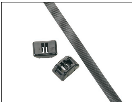
Heavy Cross Section Textured strap body and robust head design for reliable installations