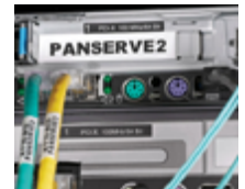
Network Infrastructure Labeling