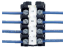
Terminal Block Labeling