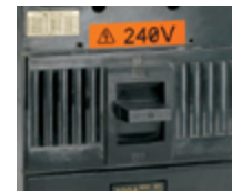
Electrical Hazard Labels