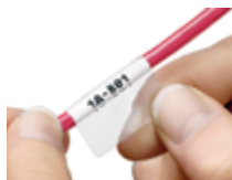
Wire and Cable Marking