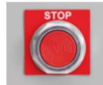
Raised Panel Labels