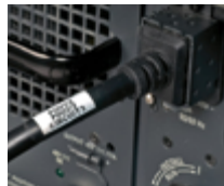
Electrical Infrastructure Labeling