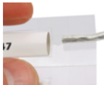
2-Sided Heat Shrink Labels