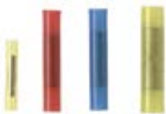
Butt Splice Vinyl Insulated