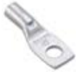
One-Hole Standard Barrel Lug