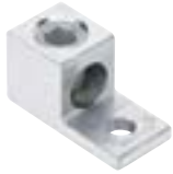
One-Hole Aluminum Mechanical Lug