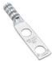
Two-Hole Long Barrel Lug