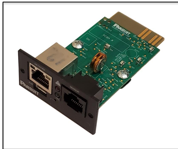
UNCP01 SmartZone UPS Intelligent Network Management Card.

The card provides more than just simple network connectivity. The iNMC can integrate UPS and Smart Load (Server) shutdown management solution. Its integrated smart shutdown technology allows shutdown of loads based on priority. Low priority loads may be safely shutdown immediately leaving more uptime for critical servers.