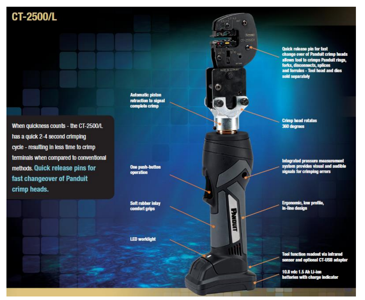
Figure 8: CT-2500/L

CT-2600/L, shown in Figure 9, is an inline, 4.0 ton, battery-powered crimping tool that uses Panduit dies to crimp Panduit terminals, butt splices, and lugs. This battery-powered tool features a flip-top crimp head that can be fully rotated, and it has a slim profile, ideal for working within tight spaces. The automatic piston retraction feature signals a complete crimp. The tool mechanics include an integrated pressure measurement system to provide visual and audible signals to alert the user of any crimping errors. This tool is equipped with an LED work light and soft rubber inlay comfort grips. It features a one push-button operation all in an ergonomic, low profile, in-line design. It utilizes an 18 VDC Li-ion battery that can be fully charged within 22 minutes. Included in this tool is an infrared sensor that allows the historical statistical performance data to be transferred from the tool to FINs software via the Panduit® CT-USB accessory.