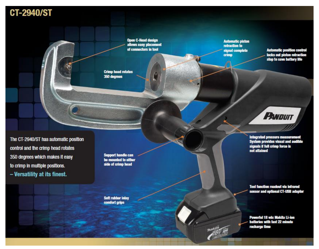
Figure 6: CT-2940/ST

CT-2980/ST, shown in Figure 7, is a 6.2 ton, pistol grip, battery-operated crimping tool that is completely dieless. This battery-powered tool features a flip-top crimp head that can be fully rotated. The automatic piston retraction feature signals a complete crimp, and the automatic position control locks out the piston retraction stop when needed to save battery life. The tool mechanics include an integrated pressure measurement system to provide visual and audible signals if a full crimp force is not attained. This tool features a one push-button operation all in an ergonomically designed, weight-balanced pistol grip tool. It utilizes an 18 VDC Li-ion battery that can be fully charged within 22 minutes.