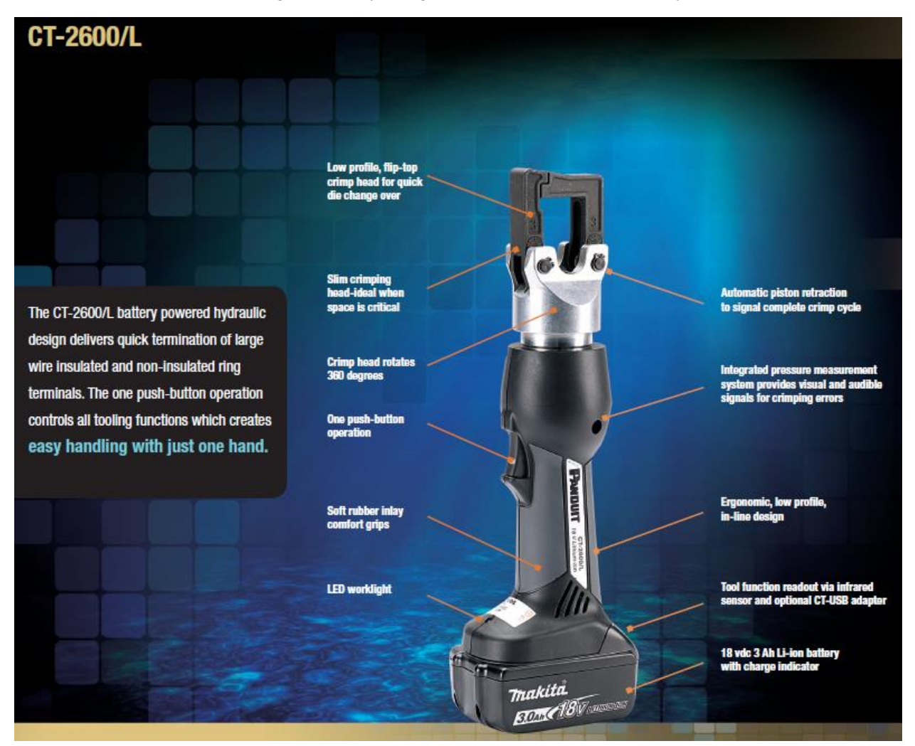
Figure 9: CT-2600/L

CT-2300/ST, shown in Figure 10, is an inline, 1.7 ton, battery-powered crimping tool that uses select Panduit crimp dies to crimp Panduit terminals, disconnects, splices, ferrules, and lugs. This battery-powered tool features a 120mm jaw for holding the crimp dies. The tool mechanics include an integrated pressure measurement system to provide visual and audible signals to alert the user of any crimping errors. This tool is equipped with an LED work light and soft rubber inlay comfort grips and comes with an innovative trigger with power sensing technology, all in an ergonomic, low profile, in-line design. It utilizes a 10.8 VDC 1.5 amp-hour Li-ion battery that can be fully charged in 15 minutes. Included in this tool is an infrared sensor that allows the historical statistical performance data to be transferred from the tool to FINs software via the Panduit® CT-USB accessory.