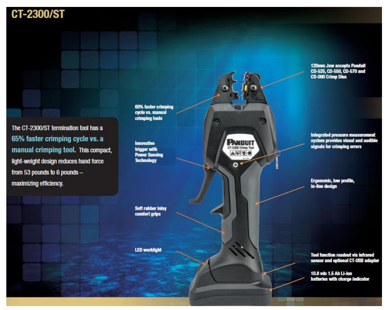
Figure 10: CT-2300/ST