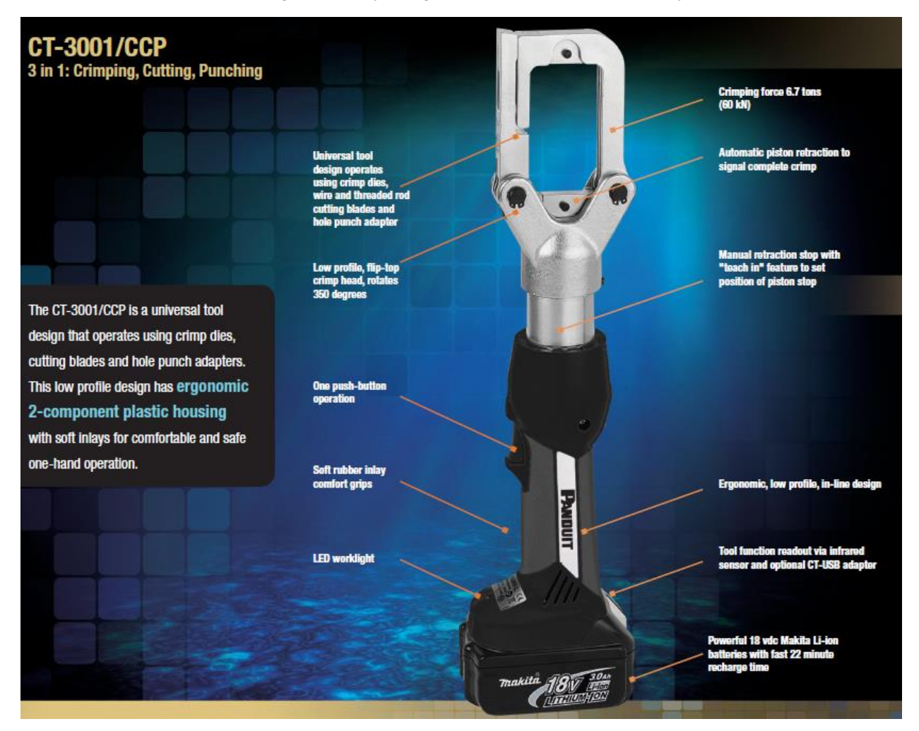
Figure 3: CT-3001/CCP

CT-2920/CCP, shown in Figure 4, is a pistol grip, 12 ton, battery-powered 3-in-1 tool that utilizes interchangeable adapters and dies to crimp, cut, and punch. It has a flip-top crimp head that can be rotated as needed. The automatic