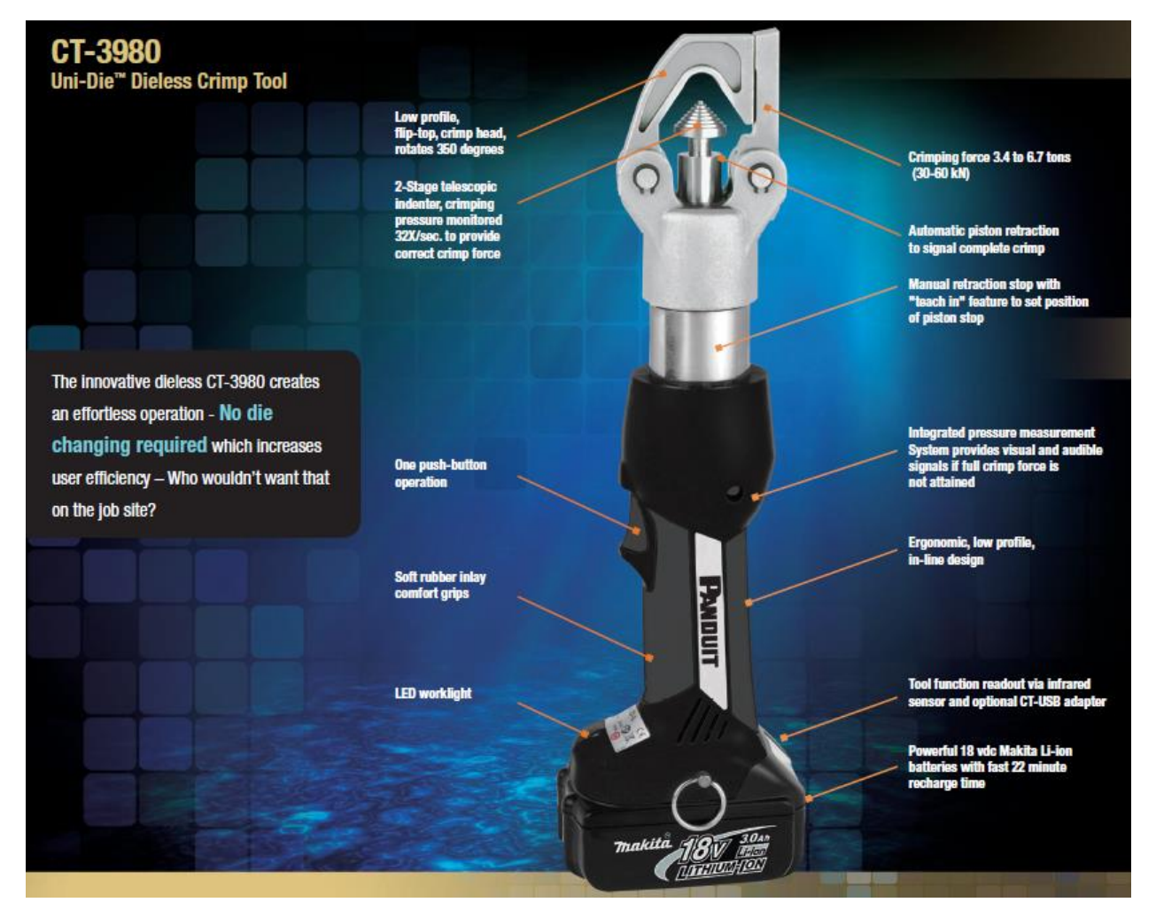
Figure 2: CT-3980