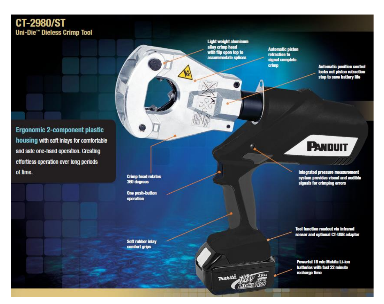
Figure 7: CT-2980/ST

CT-2500/L, shown in Figure 8, is an inline, 1.7 ton, battery-powered crimping tool that uses Panduit select crimp heads to crimp Panduit rings, forks, disconnects, splices, and ferrules. Crimp heads can be quickly changed with a quick release pin feature. The tool allows the crimp head to rotate 360 degrees. The automatic piston retraction feature signals a complete crimp. The tool mechanics include an integrated pressure measurement system to provide visual and audible signals to alert the user of any crimping errors. This tool is equipped with an LED work light and soft rubber inlay comfort grips. It features a one push-button operation all in an ergonomic, low profile, in-line design. It utilizes a 10 VDC 1.5 amp-hour Li-ion battery that can be fully charged in 15 minutes. Included in this tool is an infrared sensor that allows