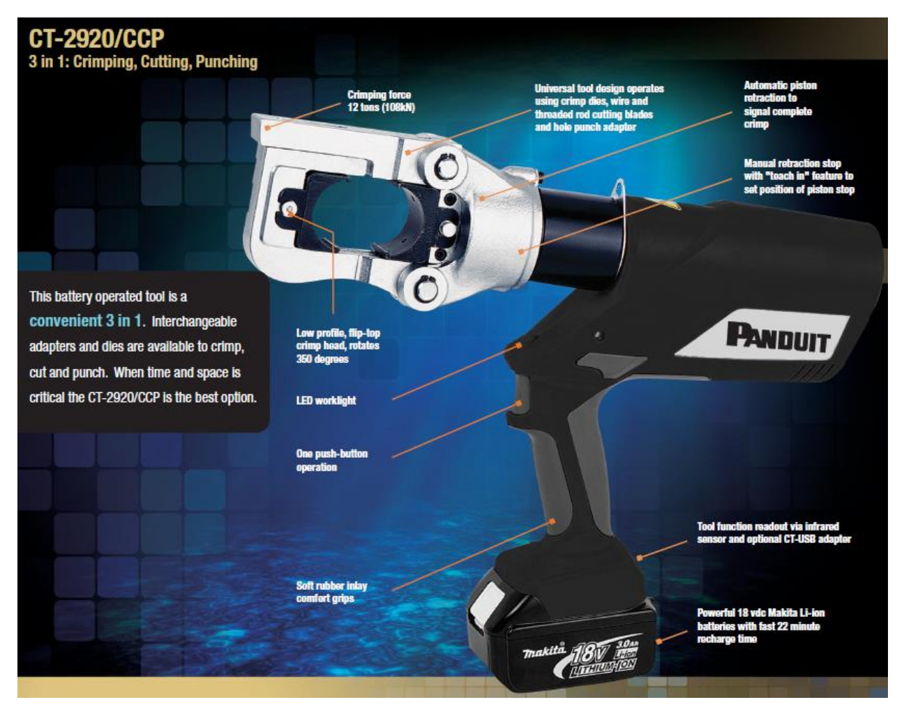
Figure 4: CT-2920/CCP

CT-2931/ST, shown in Figure 5, is a pistol grip, 12 ton, battery-powered crimping tool that uses Panduit select dies to crimp connectors and lugs. It has an open C-head to allow easy placement of connectors in the tool. As an option, the tool can be ordered with an incorporated 2-layer PVC insulation over the metal crimp head for added safety in certain environments. The automatic piston retraction feature signals a complete crimp, and the automatic position control locks