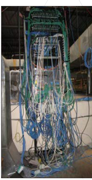
Figure 2. Poor Industrial Network Installation Can Generate Unacceptable Downtime Risks

Historically, the industrial network has been the responsibility of the manufacturing organization and all other networks have been firmly under the control of the IT organization with little connectivity between. One common complication has been the tendency to install IT equipment without full consideration for the high availability and security requirements of automation systems (see Figure 2). Another spot where problems may arise is identifying if IT or