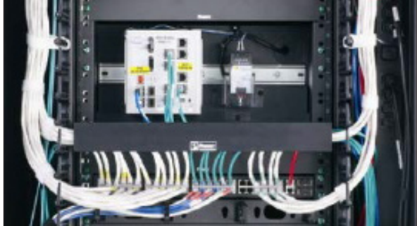
Figure 5. Manufacturing Switch Mounted on a DIN Rail Bracket

There may be cases where network designers may wish to combine DIN rail mounted devices within racks (components such as PLCs, gateways, manufacturing switches, etc.) in order to save space. Placement of DIN rail mounted devices in the MDC may help achieve this benefit by eliminating separate enclosures while closely linking DIN rail mounted devices to the network (see Figure 5).