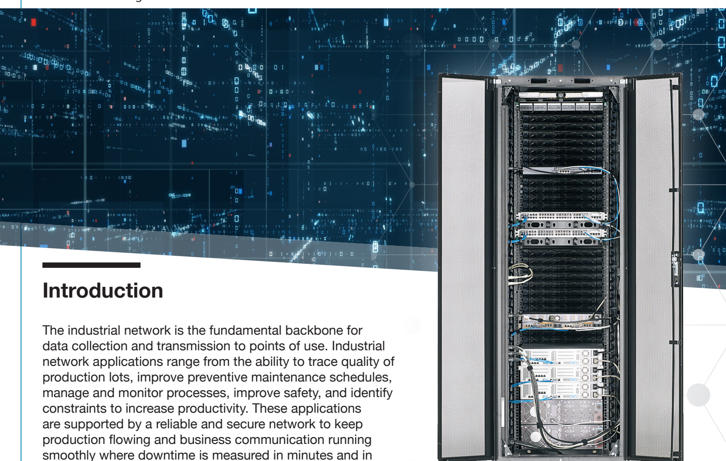
Figure 1. Featuring MDC79D

Office-grade IT equipment often is deployed in the industrial space, with additional environmental protection required. Automation vendors are integrating Ethernet connectivity at all levels of manufacturing starting at the bottom with sensors to PLCs and up to manufacturing servers and switches. Crucial to success is ensuring that the linkage between these systems is secure, environmentally protected, and optimized to speed diagnostics and problem solving; reserving the ability to isolate the networks when security threats to production arise.