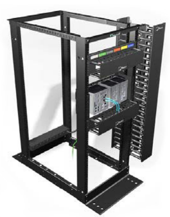
Figure 4. Example Panduit 4 Post Rack (half or full) with Cable Management Deployed for Micro Data Center Application

Racks can be a 2 post or 4 post design. Typically, a network rack with shallow switches can fit a 2 post design. Larger and heavier equipment is best handled by a 4 post design, especially if mounting servers. If combining servers and switches together in the same rack, a 4 post design should be selected to provide greater design flexibility.