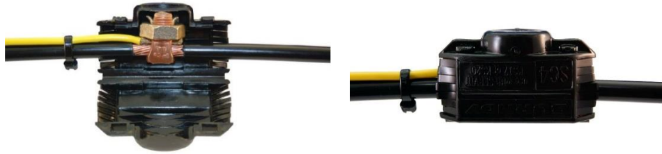
Figure 1: Sensor leads are secured with cable ties near the termination point

In addition, the sensor lead terminations should be inspected periodically, similar to other critical terminations inside an electrical enclosure, to ensure they are tight and the sensor leads are secure.