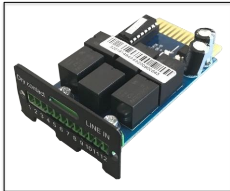
URC005 SmartZone UPS Relay Card.

The Panduit relay card is used to provide UPS internal status to the outside or control peripheral devices according to UPS status in the form of Form-C dry contacts. Simply connect the monitoring solution power source to the Common Source input and connect the monitoring solution to any or all the relay card's status outputs.