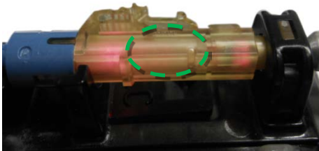
Glow indicates proper termination