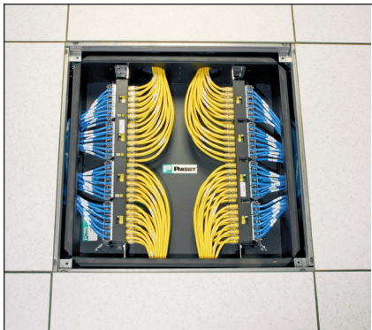
PZRFE4U with Copper Connectivity