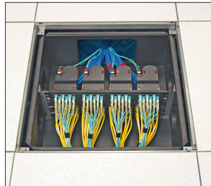
PZRFE8U with QuickNet™ Copper and Fiber Connectivity